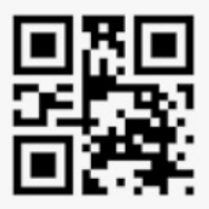
Sample QR code

The QR code has been sent to the email address that you gave earlier. This code is required when you enter the church building. You can have it saved on your mobile or have it printed out.